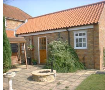
Church Farm Holiday Cottage

Joe and Kay Donocik have a holiday cottage at Church Farm, off Station Road, which opened for the Christmas Market in 2000. It looks across the Wolds, has a double bedroom and a bedroom with bunk beds plus all mod. cons including a parking area. (Tel: 01507 313737)