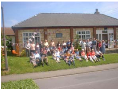
The village celebrating the Queen's Golden Jubilee

Finally, he said that the Parish Council was working closely with the Village Hall committee and the first benefits of this was the launching of the village newsletter