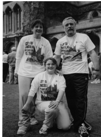
The successful runners (see page 4 for details)

Currently there is background information on the village, details of services available within the village, transport and travel details as well as other news items. There are also de-