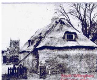
Woodbine Cottage, South Willingham not long after the line had closed

fiercely but the guard and fireman successfully uncoupled the rear wagons. The train moved on, the burning wagon was detached, and the remainder of the