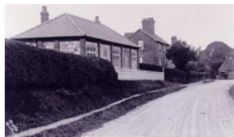
The village hall, about the same time.