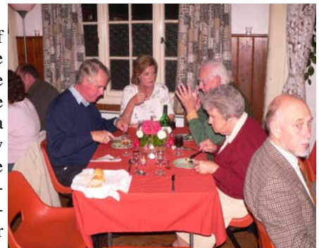
Tucking into the Harvest Supper in September