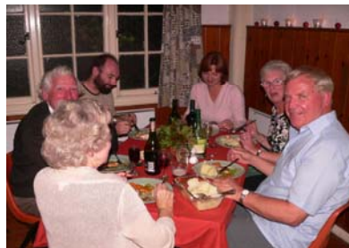
More enjoyment at the Harvest Supper in the Community Hall.