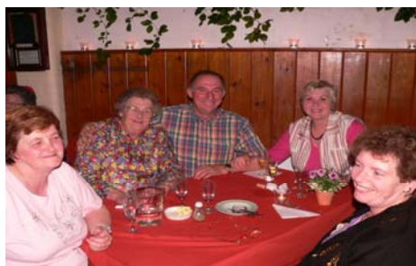
Another table at the Harvest Supper