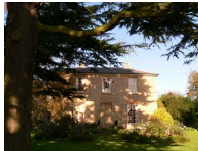
The Old Rectory, South Willingham in 2005