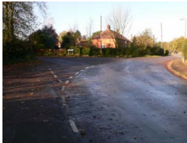
The site of possible changes to the village centre

ton/Station Road junction to change the “Give Way” signs to “Stop” signs and to encourage the maintenance of hedges/trees to improve visibility