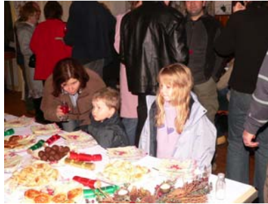
Still waiting for Santa Claus but there are other attractions....

more boundary stones marked 'H' on the east and 'DC' on the west. The cost of this enclosure (excluding hedging and