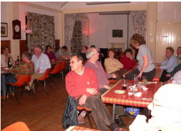
Having a good time at the Burn's Supper

We have bought a cooker to replace the defunct one and it should be in operation for the Chinese New Year evening.