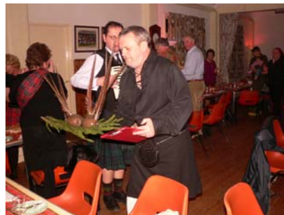
The Haggis complete with feathers arrives at the table.

please contact one of the above – phone numbers on back page.