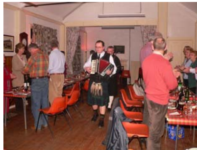
The Haggis being "piped" in for the Burns Supper

expressed the right sentiments and Rabbie was duly honoured. As the Scot's spirit in both senses got going, the celebrators danced the Gay Gordons – the first time we have seen dancing in the Hall for many a day.