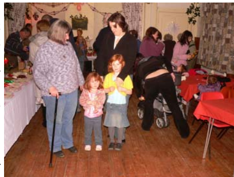
Waiting for Santa Claus at the Christmas Fayre in the Hall

The Parish Council considered this but were concerned that the only practical place to put such a recycling facility is in the village centre next to the bus shelter. Such a facility comprising 5 bins with