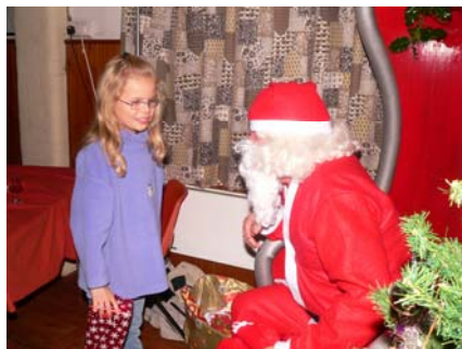
He's here at last