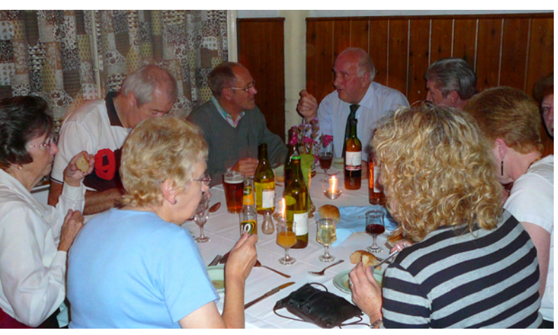
Wine harvest, South Willingham Community Hall!

"As it is a wellknown food for the brain, fish was taken at half-time"