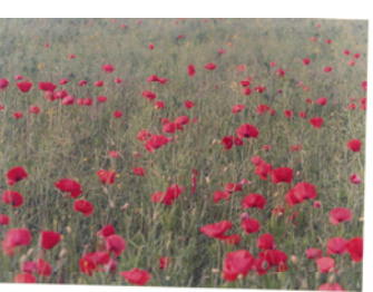
Just like Flanders fields

Mind you, you never know what people's feel-