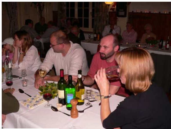
Another table at the Harvest Supper with diners looking relaxed before being fleeced at the auction!

New members are always welcome and for the modest cost of £1 per month per number you too could be a village lottery winner. Each month monies collected are shared equally between the winner and village hall funds. Come and join us – ring John Sturgeon now – 313718 – and have the chance of being the next lucky winner.