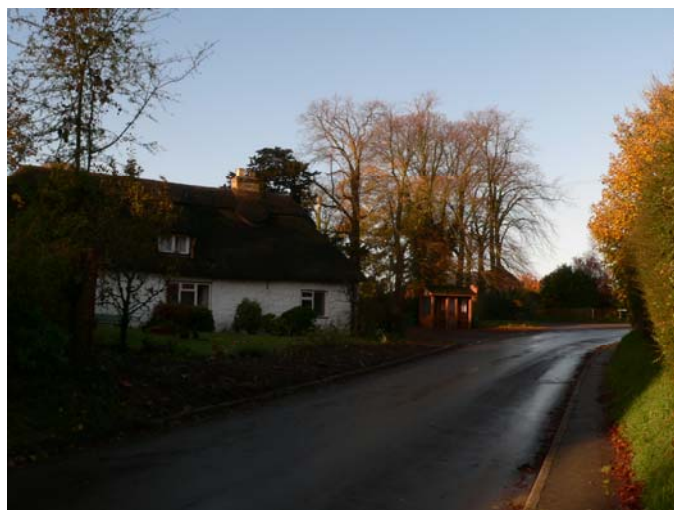
A view not seen for many years – light and beauty.

For those of us who live at the south eastern end of the village, the bit of Station Road just below the Old Post Office has been dark and dangerous at times. The trees along the side of Woodbine Cottage had grown tall and wide, narrowing the road, and because that part of the road is not reached by the street lights, it had become impossible to navigate on a dark night without a torch.